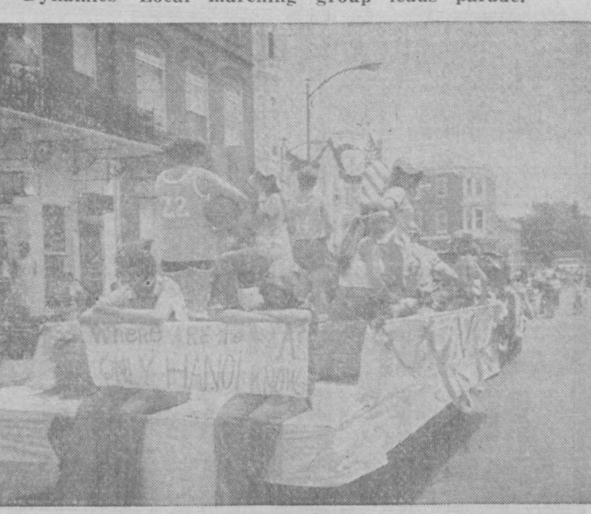
CYO-Local youth float emphasizes patriotism.