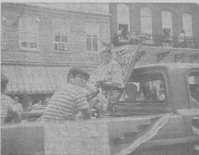
VFW Auxiliary float with "Betsy Ross" working on

ready to experience something Scenes From July 4th Parade Here