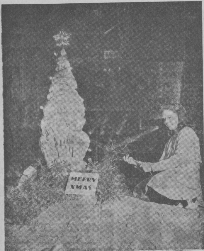
OLDEST CHRISTMAS TREE DECORATED

EMMITSBURG THURMONT HILLCREST 7-3781 CRESTVIEW 1-6111