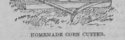
HOMEMADE CORN CUTTER.

A Simple Corn Harvester. The idea comes from Australia, where the machine is used in harvesting sugar cane and sorghum, as well as corn.