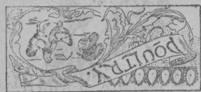
FASHION IN POULTRY.

At Certain Times a Certain Breed Will Take the Precedence.