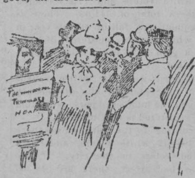
'Arriet- "I don't believe 'alf them delusions is real."-Punch,

"Pa said he didn't doubt 't all, an' be read and remembered by all Amer- then he went off to ride an' ma went to cleanin' up the kitchen. "But pa got his wheel fixed up awful