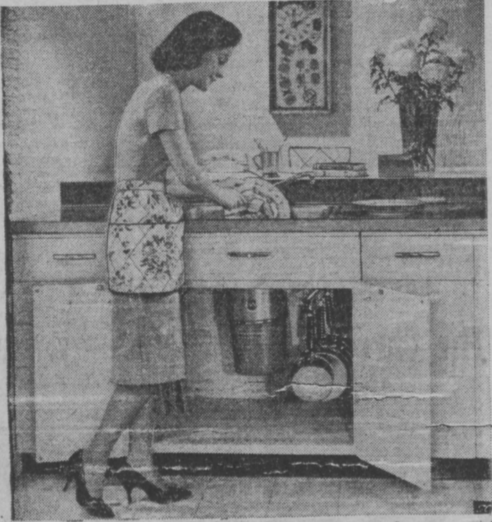
Slide-out racks, Disposall, transform sink cabinet into efficient cleanliness center.

When you're planning home improvements, "thinking big" must be coupled with "thinking practical" in order to reconcile your dreams with your budget. For a starter consider the little projects you can afford. The cleanliness, convenience, and efficiency of your ideal kitchen can be achieved in your present kitchen through step-by-step renovation of smaller kitchen areas. Just such an area is the sink cabinet, which you can transform into an undersink tidiness center outfitted for convenience without clutter. For literally liquidating food wastes and washing them down the drain, an electric food waste disposer is a must! New models of the General Electric Disposall incorporate the additional refinements of a sound shield and extra-efficient Carboly cutting device for faster, finer, whisper-quiet operation. To the side and top of the sink cabinet you can attach "disappearing" pan and towel racks which slide their contents out for easy access. Additional convenience results from glide-out storage bins in which cleaning supplies can be grouped together and organized, rather than accumulating haphazardly on the cabinet floor where they are in danger of being overturned or broken in a fumbling search. Put them all together, they spell efficiency... and many household problems conveniently and attractively solved.