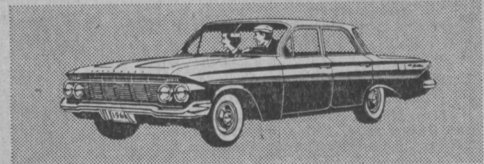
New Bel Air 4-Door Sedan—Popularly priced and packed with all the Chevy virtues.