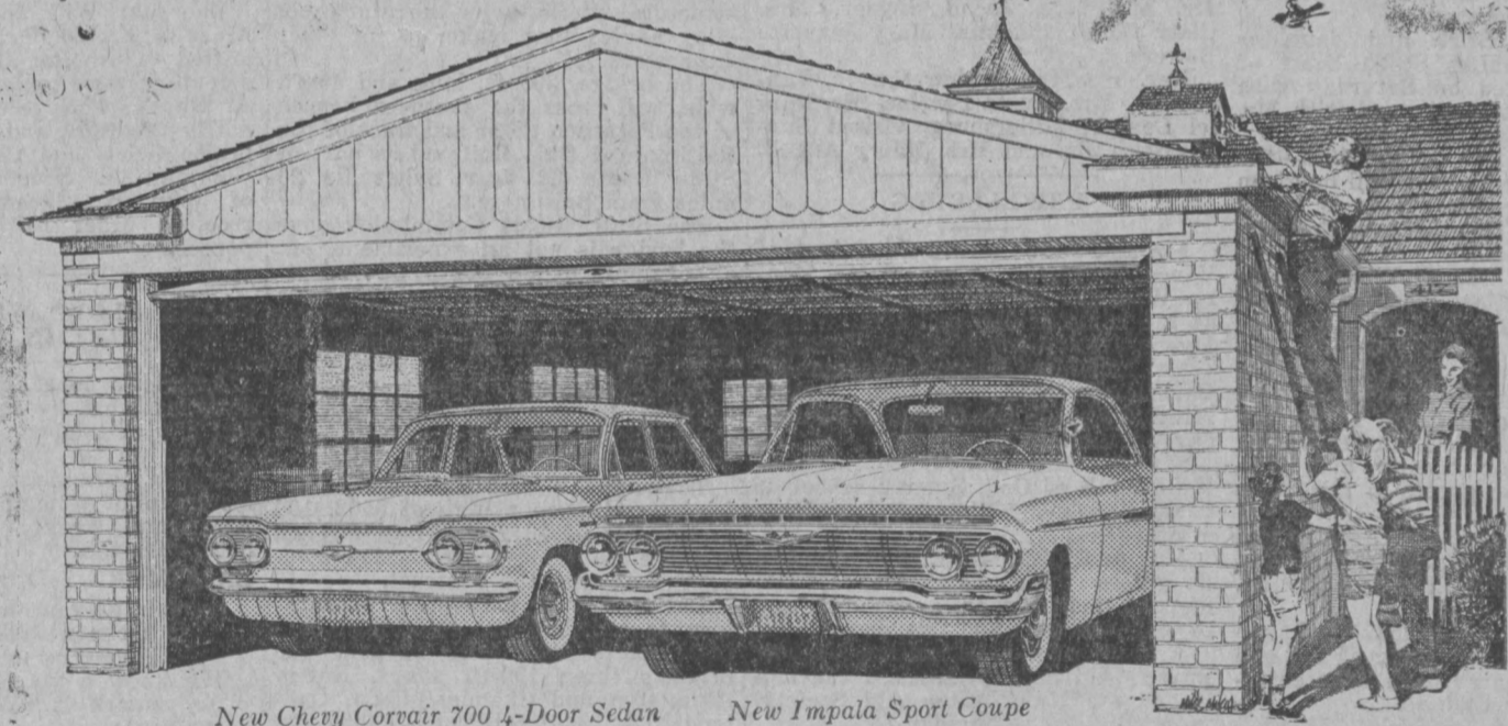
New Chevy Corvair 700 4-Door Sedan

Ask your dealer about a real cool extra-cost option—Chevrolet air conditioning.