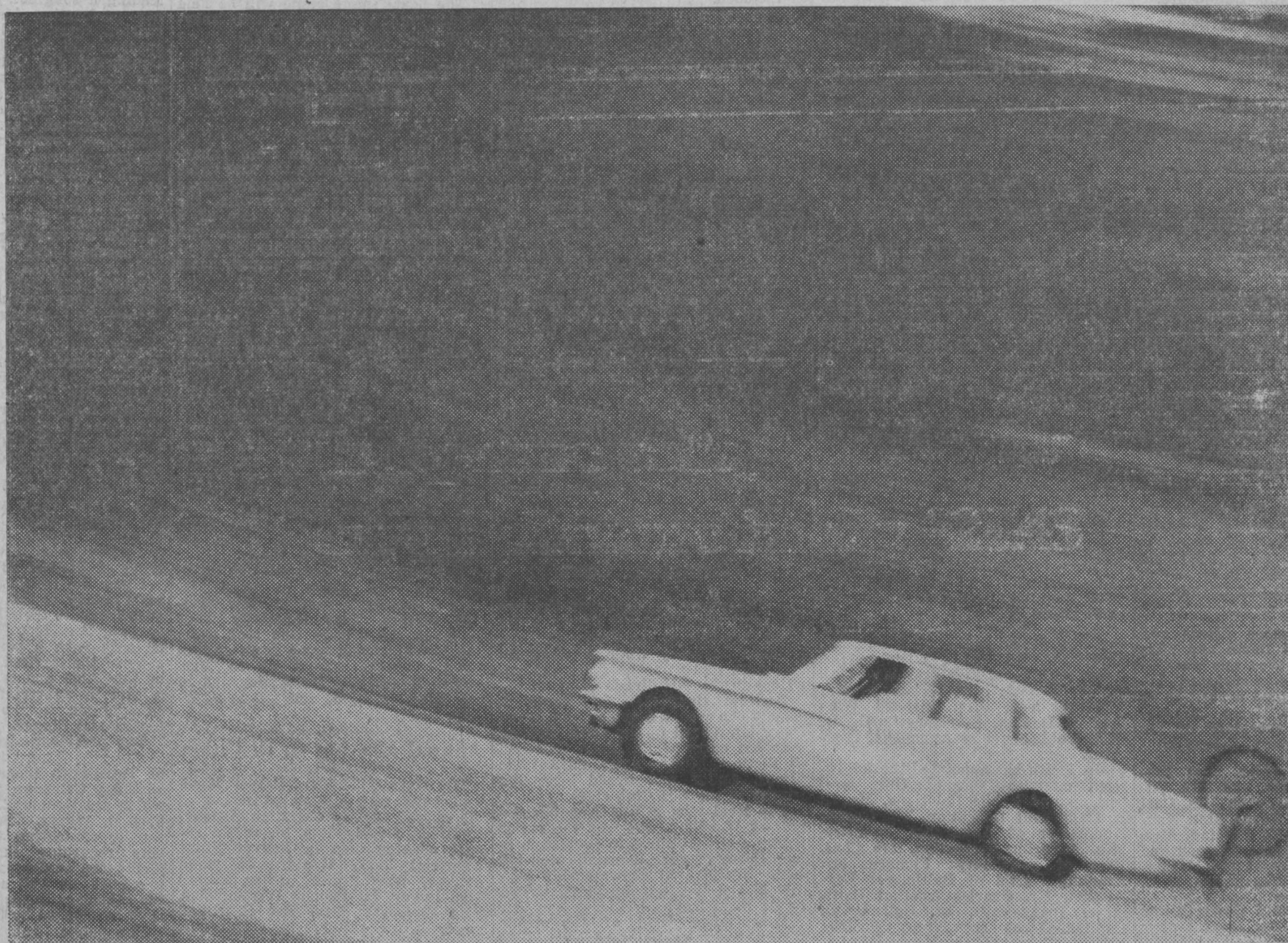
Shell experts test for knock by accelerating up steep grade. In another test, that "fifth wheel" in the back is lowered onto the road to measure mileage precisely.