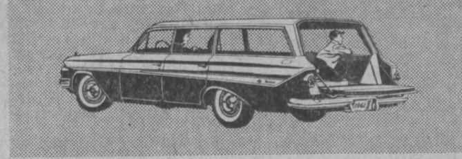
New Nomad 9-Passenger Station Wagon—Most luxurious of Chevy's six best selling wagons.

See the new Chevrolets at your local authorized Chevrolet dealer's