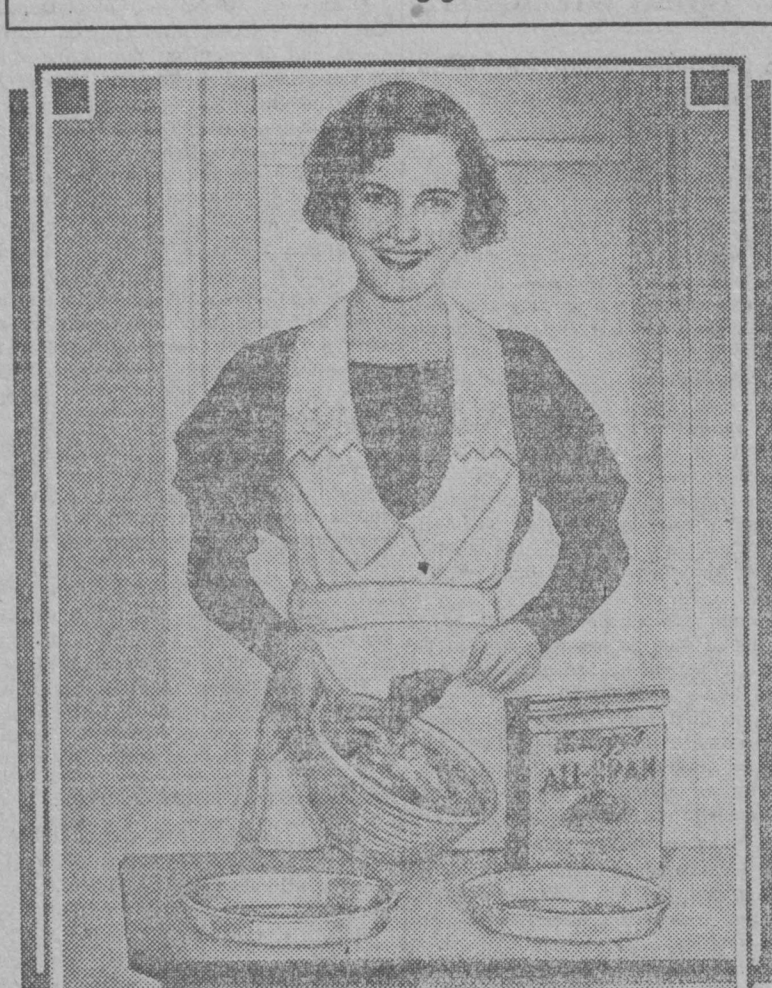
Lois Moran whose acting has been an important factor in the acclaim won by "Of Thee I Sing", and whose waffles are as flawless as her acting.