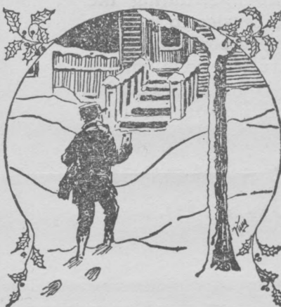
A House Loomed Up Before Him.

Darkness had fallen and shifting crowds of people hurried, good-naturedly, through the packed shopping district of a large Western city, on one of the Great Lakes. The crowd flowed like a human river with cur-