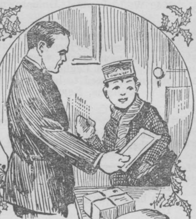
"I've Seen That Lady Before."

"Merry Christmas," she called softly, holding a lamp high over her head, as the Christmas Angel slowly made his way down the walk, and out into the night. "Giff my luff to your ma,"