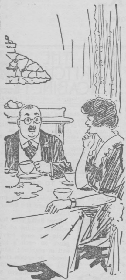
"I Have Made Up My Mind to Marry That Clerk of Yours."

Emma was ordered not to think of John Cartwright any more and to hold herself in readiness to marry some one to be picked out for her by her parents hereafter. Emma was a pretty young thing with not much to her,