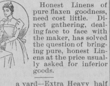
TABLE LINENS Housekeeping Linen

At 60c. the new mixtures, including the popular blues, 50 A Special Bargain Purchase this