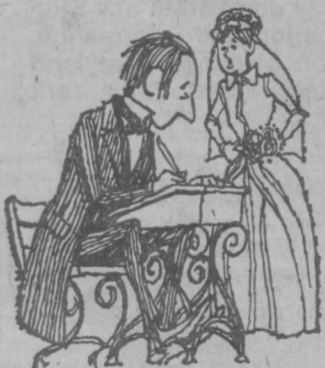
Andrew Johnson, the 17th President of the United States, did not learn how to write until after he was married. His wife taught him.