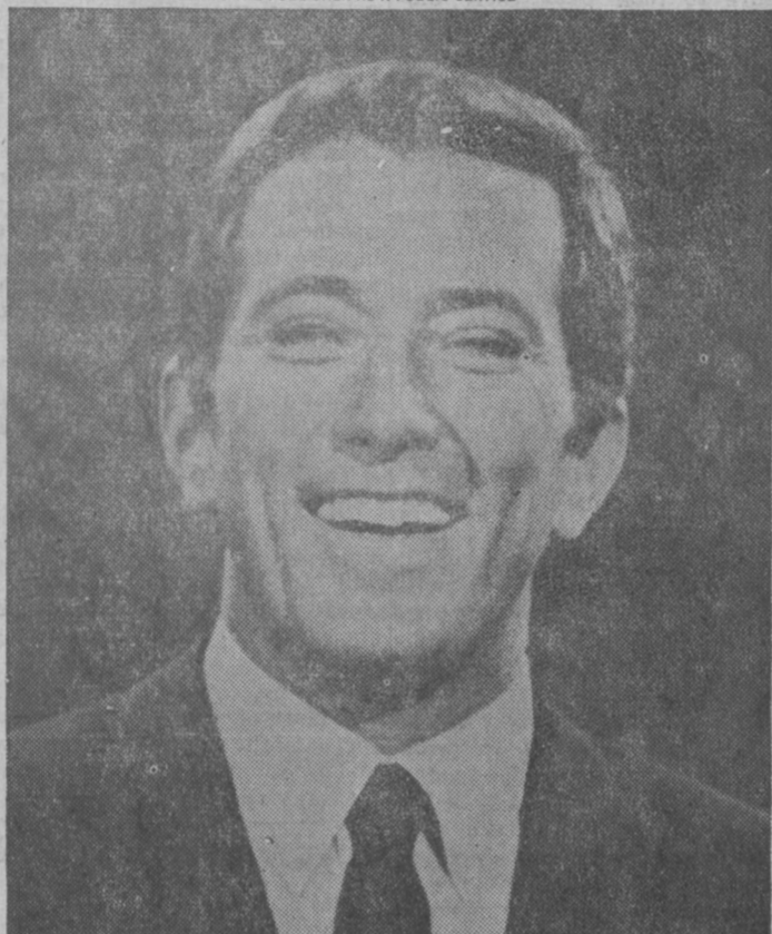
Mr. Andy Williams

THIS SPACE CONTRIBUTED BY THE PUBLISHER AS A PUBLIC SERVICE