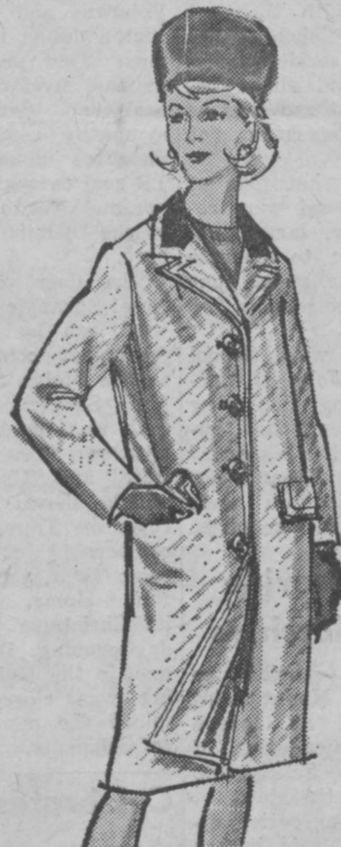
A festive gift of sedate style, elegant black and white checks, and a plush velvet collar . . . give her a Chesterfield Coat of wool blend with a warm lining. Sizes 10 to 16.