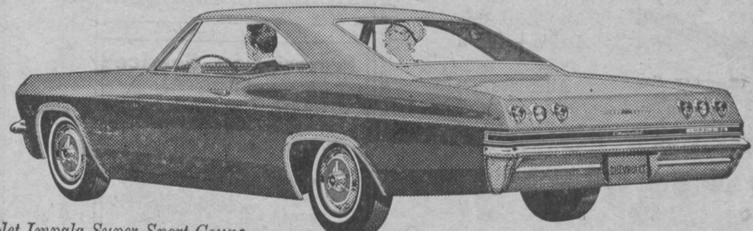
'65 Chevrolet Impala Super Sport Coupe

They're in our showroom now—ready for you to see and drive. So come on in and get the full story on the beautiful new Chevrolets for '65.