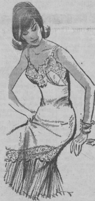
Regal princess or tailored slip with a festive frosting of lace; serviceable nylon that will not ride up; comfortable, long lasting fit. Regular sizes 32 to 42.