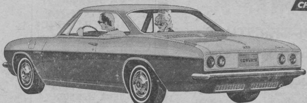
New Corvair Corsa Sport Coupe

It's a longer, lower, wider, roomier, quieter, handsomer, swankier kind of Chevrolet. Fact is, just about everything's new right down to the road. And even that'll seem newer. Because now Chevrolet's Jet-smooth ride is smoother than ever. And we're itching to show it off.