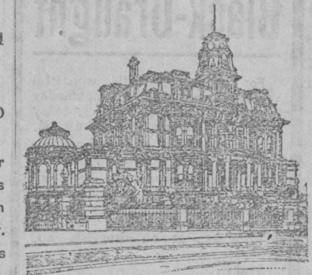
The Crocker Mansion, Destroyed By Fire.

Temporary Quarters For Homeless. Vigorous measures are being taken by the board of health and the board of public works to improve the sani-