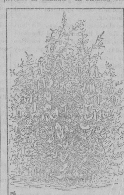
CANADIAN FIELD PEAS. Trust with the magnitude of the peas is its insignificance in our own country.

The term Canadian field peas, or, as it is more commonly expressed, "Canada field peas," is used with much latitude in this country. Ask a pea grower in the United States as to the variety of seed which he sowed and the almost invariable answer given is, "I sowed Canada peas."