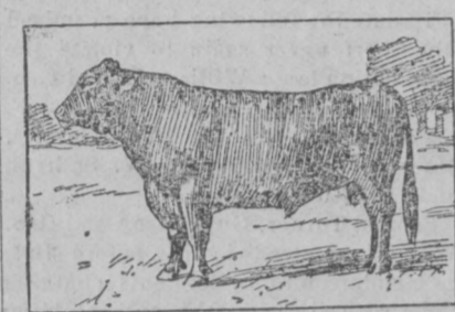
RED POLLED BULL DEMON.

One of the Youngest Breeds of Milk and Meat Cattle. The Red Polled is one of the youngest of the breeds. It was not until the year 1849 that the union of the Norfolk and Suffolk breeders gave the breed its name. From the start this breed has been famous as one valuable alike for dairying and for beef production.