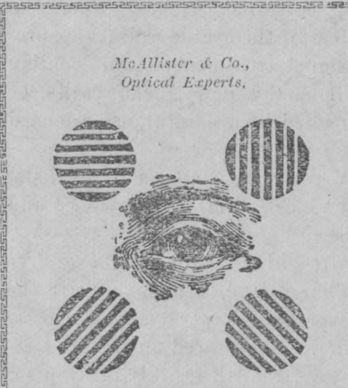
Can You See These Lines With Equal Distinctness?

If not, then it is ninetynine out of a hundred chances that you need glasses; consult us-we'll not charge you anything to examine your eyes and find out the trouble.