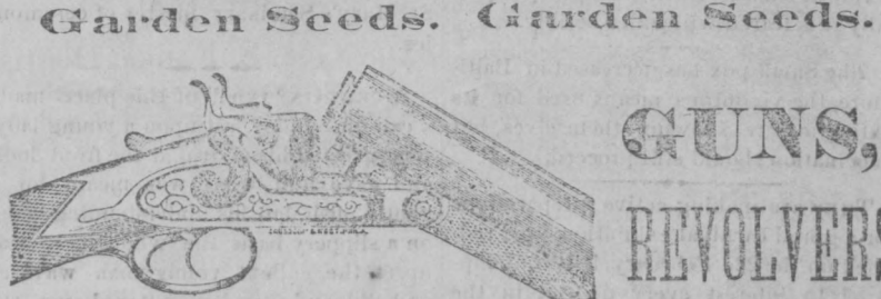
Table and Pocket Cutlery in endless variety and of the latest styles. Dinner and Tea Knives, Carvers, Silver plated Knives, Spoons, Forks, Butter Knives, Waiters, Nickle plated Shears and Scissors.

Paints, in Oil and Japan; Varnishes and dry Paints Empire Rubber Mixed Paints, always ready for use. The celebrated Toledo Cucumber Pump, the best in the World and warranted to ive