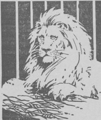
"The Keepers Gave Me this Great Log."

"Of course, it would mean more if we could wander—it might even mean